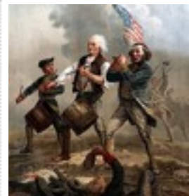
Spirit of '76 Painting

A New Country with New Symbols is created