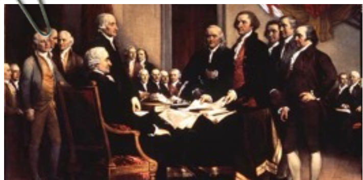
Writing the Declaration of Independence